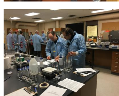
Coat the Pill - Engineering with Chemistry and Biology